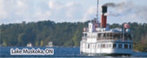
Lake Muskoka, ON