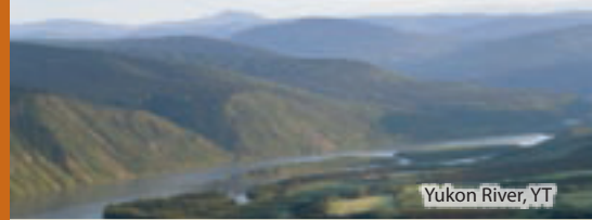
Yukon River, YT