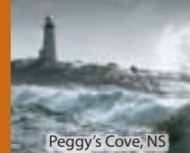
Peggy's Cove, NS